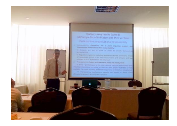
Figure 1: Introduction by Dr.Cadman (GU)