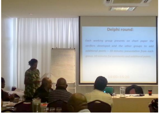
Figure 6: Group presentation