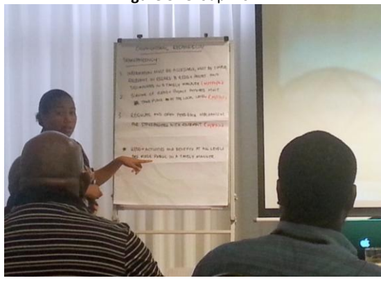
Figure 5: Group presentation